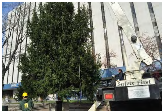
Norwalk's Christmas tree is raised recently at its final destination on Washington Street. The tree lighting will take place at 6:30 p.m. Thursday.